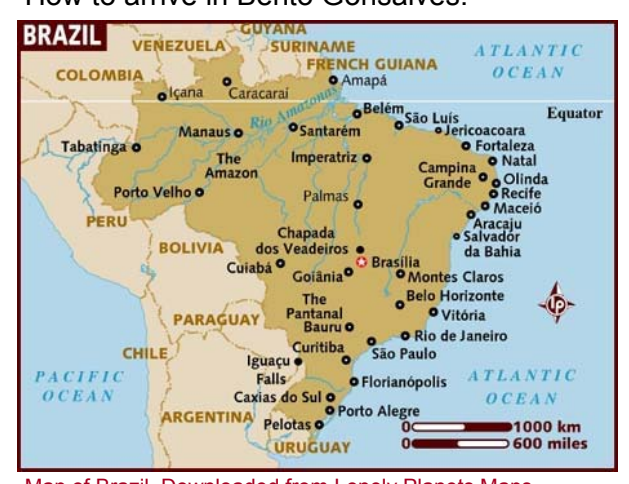
Map of Brazil. Downloaded from Lonely Planets Maps. http://www.lonelyplanet.com/maps/south-america/brazil/

The nearest town with an airport to Bento Gonsalves is Porto Alegre.