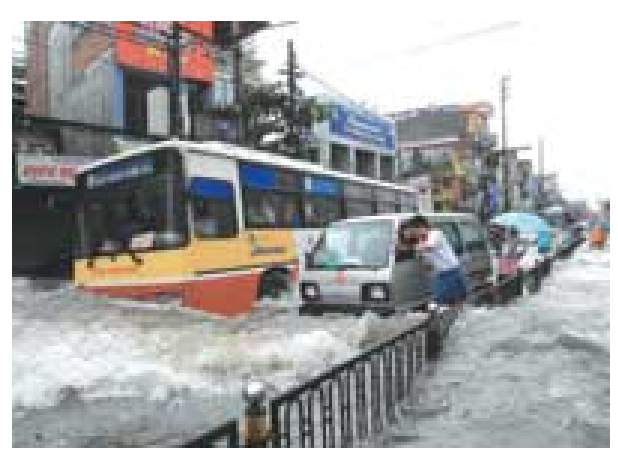
Continuous heavy rains cause serious flooding and traffic jams in many streets in Ha Noi.

From 30 October to 1 November a number of preparatory WITFOR 2009 meetings took place in Hanoi, Vietnam. These were combined meetings of the International Steering Committee, the subcommittees of the National Organizing Committee and the Commissions. Thanks to the participation of many colleagues from both inside and outside Vietnam the preparations have been taken an important step forward. On behalf of all the international participants I want to express a great appreciation and admiration for the flexibility and commitment to attend the meetings despite the enormous problems with the weather conditions and the flood problems which were the worst in Vietnam in 35 years.