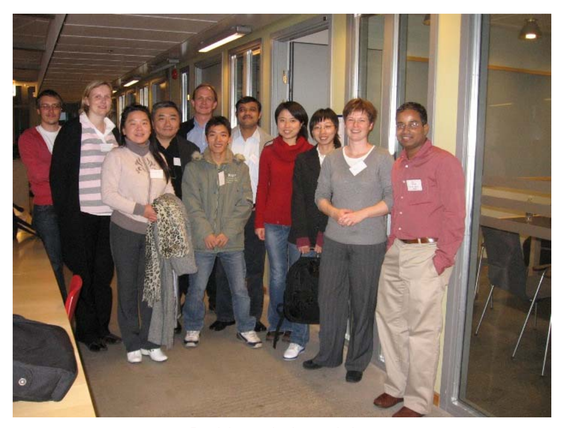
Participants in the workshop

T he workshop had participation from more than seven different countries, including USA, China, Japan, India and Germany.