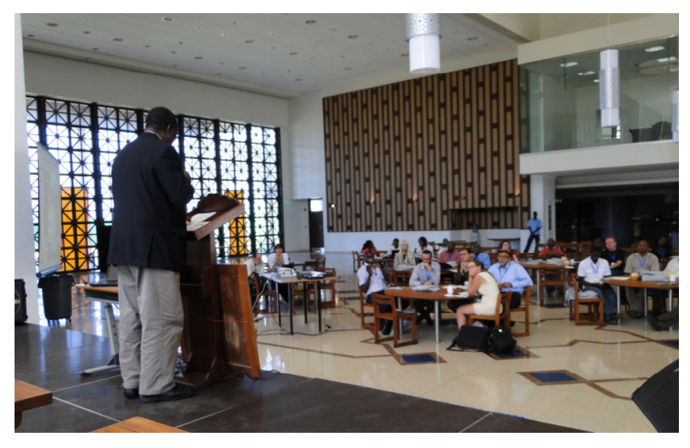
Assistant Minister of Education of Kenya addresses the IIGWE2011

Because of the special venue in Mombasa this conference was not only about ICT and Informatics in education. It was also about co-operation between south and north, east and west. It was about sharing experiences and knowledge, to learn from the past and to face a common future. Practitioners and researchers were gathered to exchange their views and practices. Just to give some impression of this collabarative approach: during the opening session the Assistent Minister of Education of Kenya spoke about the importance of ICT in Education in his country. He addressed an audience not sitting in rows, but at round tables. Perhaps this could be the new standard for IFIP conferences!