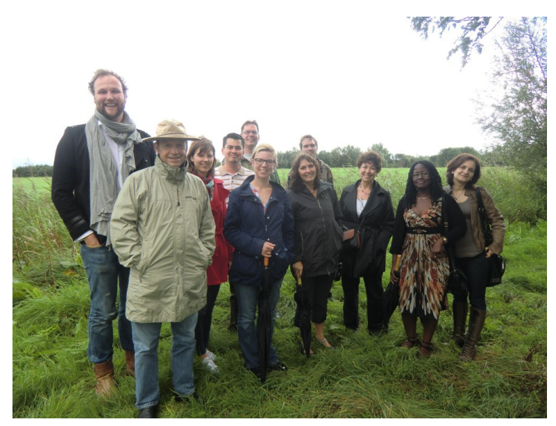
The Ph D colloquium participants after a walk in the swampy field of the Art Centre

The Seventh Ph D Colloquium co-organized by the IFIP WG 8.5 on Information Systems in Public Administration was held a day prior to the official opening of the E-Government and e-Participation conferences, at the Art Centre in Delft. The colloquium brought together seven students from universities in Europe. The students presented their research to the senior e-government and e-participation researchers who gave them feedback on the feasibility of their studies, the research methods, the aims of the