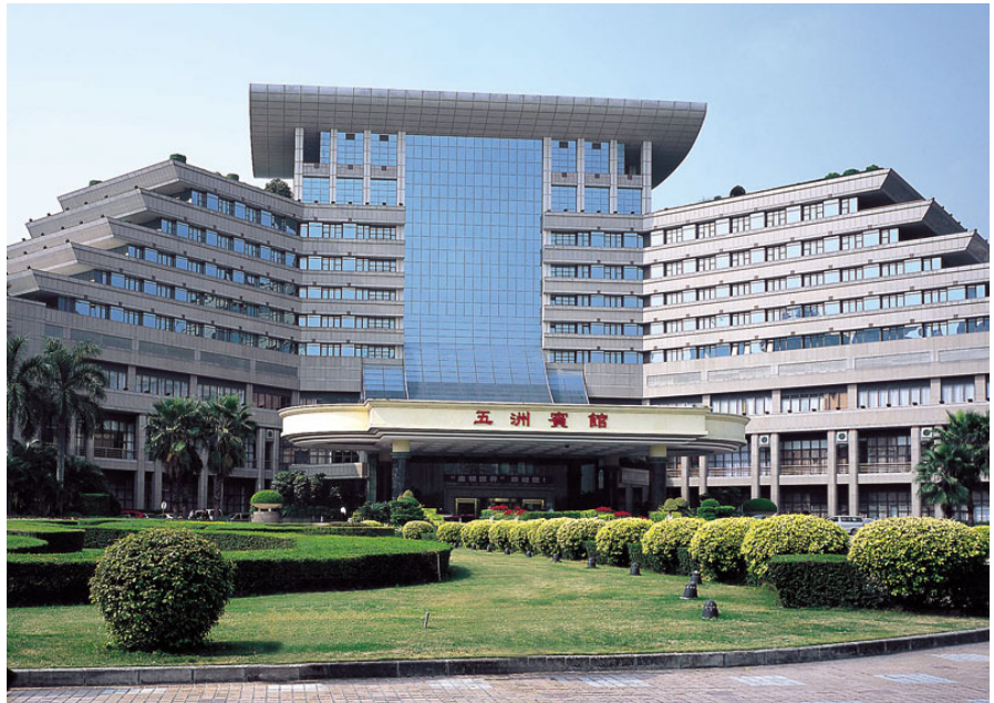
Shenzhen Wuzhou Guest House

As the initiator of the proposal, the first World CIO Forum will be held in China. Authorized by IFIP executive committee, the Chinese Institute of Electronics will organize this forum. The proposal of World CIO Forum is also approved by IFIP members, the Ministry of Industry and Information Technology of People's Republic of China, State-owned Assets Supervision and Administration Commission of the State Council of the People's Republic of China, Ministry of Commerce of the People's Republic of China, Ministry of Science and Technology of the People's Republic of China. China Science and Technology Association and People's government of Shenzhen.