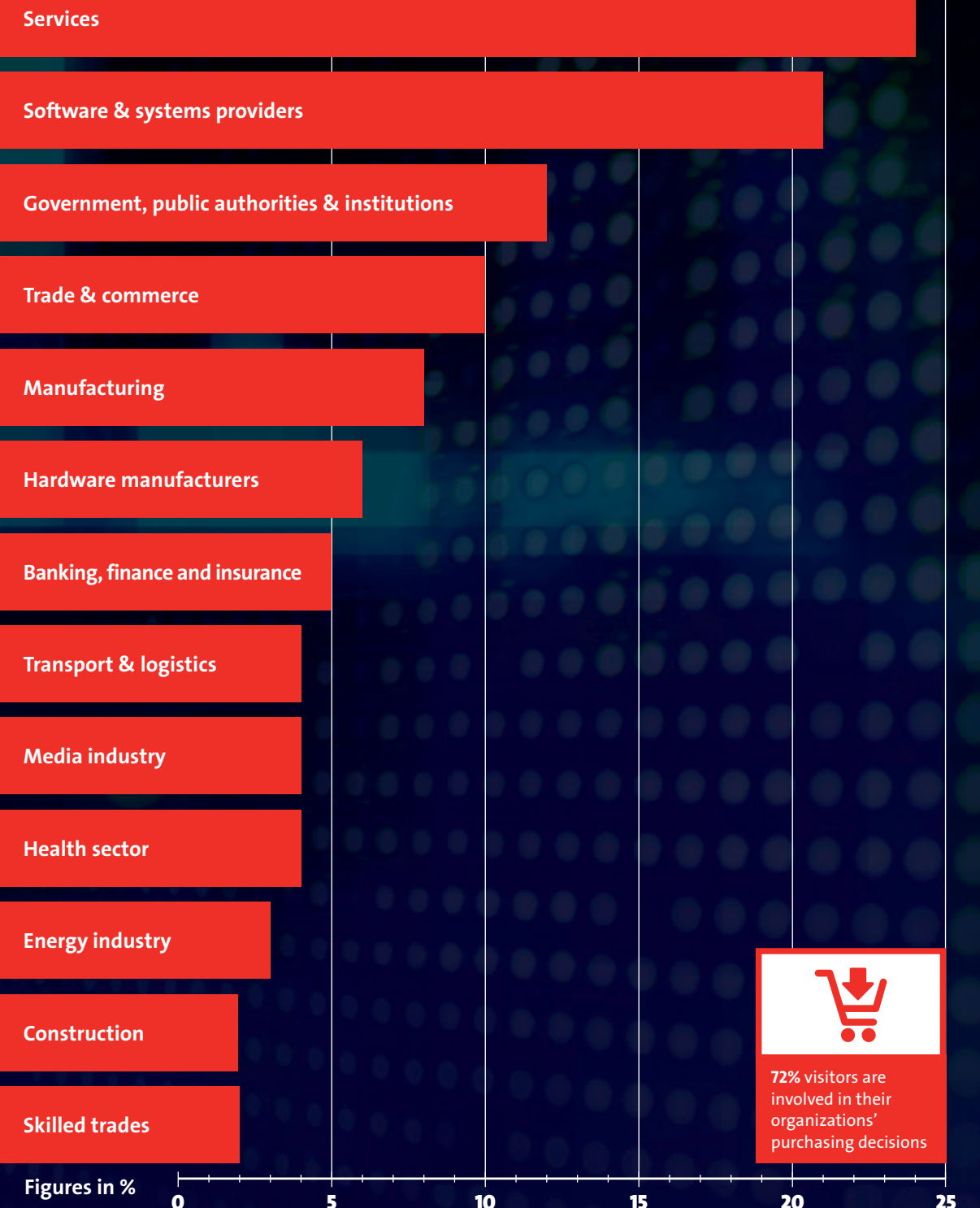
Trade visitors* from diverse business sectors